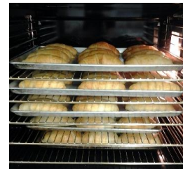
This is half of the oven!

Thank you to all who participated in the silent auction last year! Your generosity and involvement was a complete blessing! The convection oven that was purchased with the money was such an incredible addition to the kitchen and we ate some mighty fine food from it! I've never seen so many pizzas, croissants or pieces of chicken being cooked at one time!